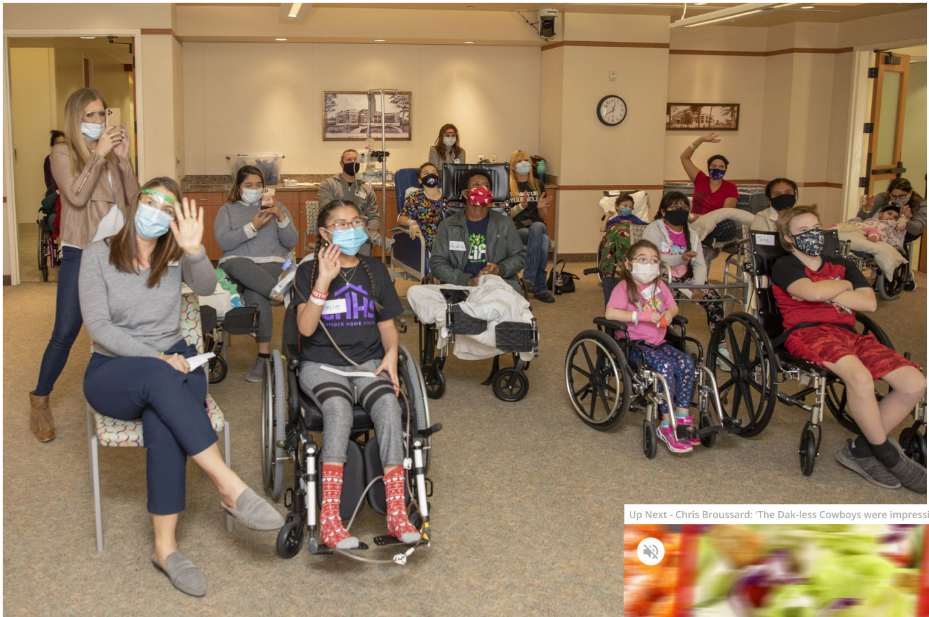
Because of COVID-19 safeguards, Cowboys players were unable to make their annual, in-person holiday visit to hospitals in the D somehow.