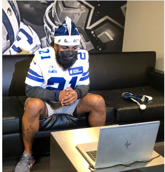
Cowboys running back Ezekiel Elliott talking with patients at one of four local children's hospitals Cowboys players virtually visited Friday, December 18, 2020.