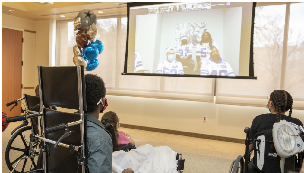
Because of COVID-19 safeguards, Cowboys players were unable to make their annual, in-person holiday visit to hospitals in the Dallas and Fort Worth area.

Because of COVID-19 safeguards, Cowboys players were unable to make their annual, in-person holiday visits. But some traditions must continue somehow.