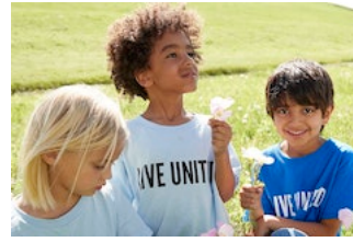
An opportuni opportunity