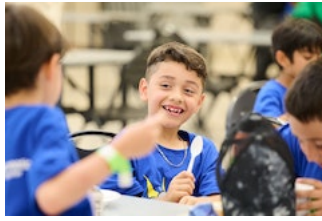
Preventing c break